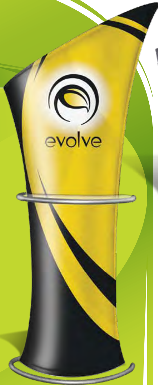
Slope Left (41" w x 84" h)

Allure offers a refreshing new twist to the traditional banner stand. It is the perfect combination of style and substance and can be used for displaying product and graphics at tradeshows, in retail environments or at special events, and exhibits.