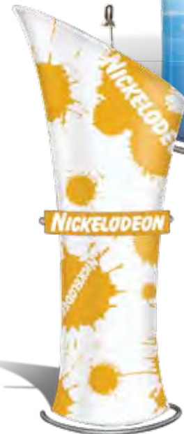
Slope Right (41" w x 84" h)