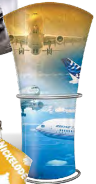
Fountain (41" w x 80" h)